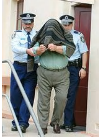
Police escort a 59-year-old man charged with child sex offences from the Mudgee Local Court after the bail hearing.