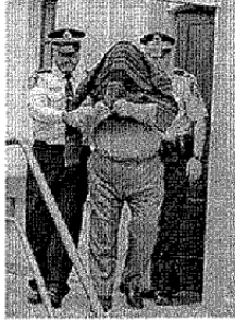
Police escort a 59-year-old man charged with child sex offences from the Mudgee Local Court after yesterday's bail hearing.